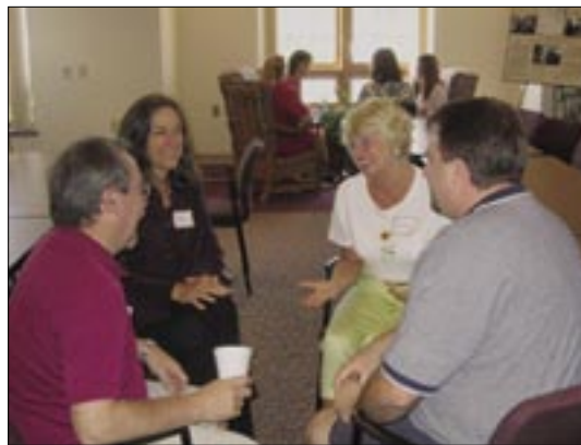
Workshop attendees in Fond du Lac.